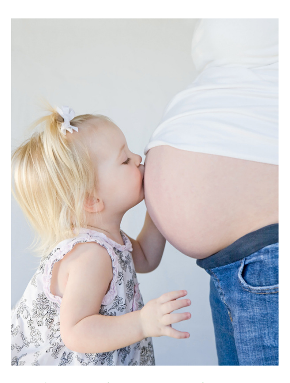
Safe and Natural Treatment Alternatives